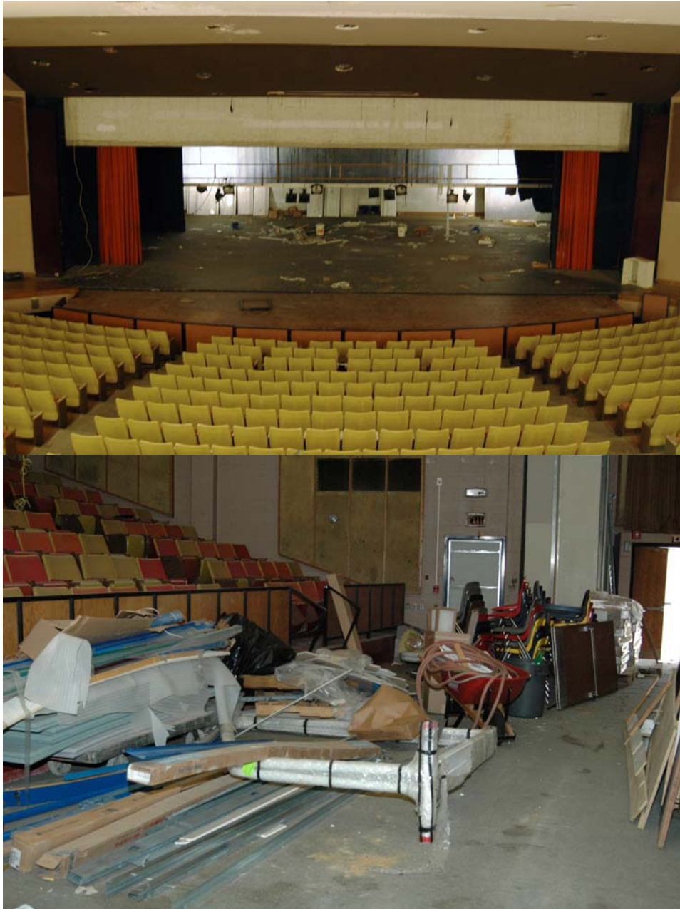
Photos of Old Blair Auditorium 2009.

For more background on the auditorium, see the Jan 10, 2010 Gazette article (Burton edition) -